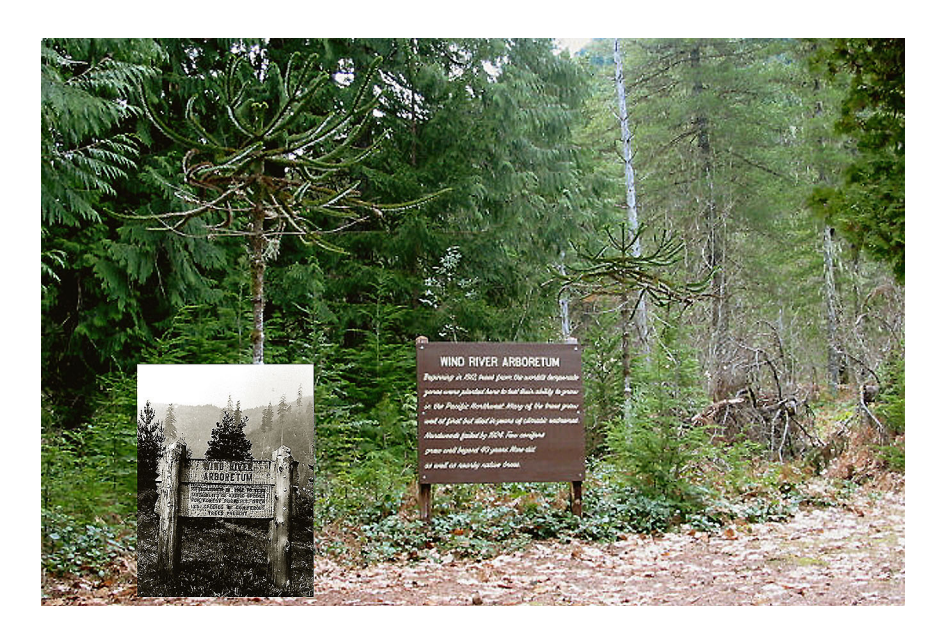
Fig. 11. Wind River Arboretum in 2003, with inset from 1912.

The Ameriflux instrumentation collects year-round data on carbon flux at this site and >90 others in North America and >200 sites in a global net-