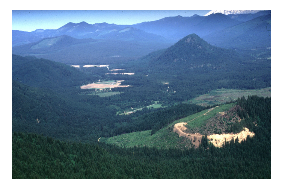
Fig. 7. Wind River Valley looking north. Mt. St. Helens is in the upper right, Bunker Hill in the center, with the old Wind River Nursery to the west, and the Trout Creek Division of the Wind River Experimental Forest is located above the nursery area.

of the experimental forest; Mt. Hood is about 50 km to the south. Within the valley and a central feature of the experimental forest is Trout Creek Hill, a Quaternary volcano, which released lava flows that filled the valley floor about 340,000 years ago. Soils within the valley, mostly derived from volcanic ash, are generally stone free and may be from eruptions of Mt. St. Helens.