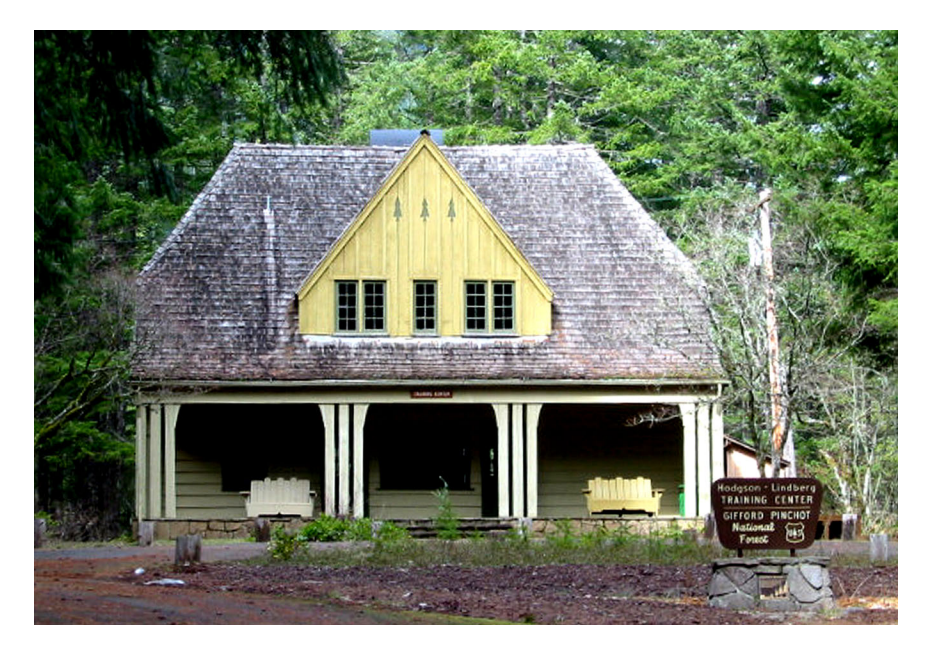
Fig. 6. The Hodgson-Lindberg Training Center at the Wind River Work Center, Gifford Pinchot National Forest, site of the WRCCRF Annual Scientific Conference, various workshops, and meetings.

western hemlock/Douglas-fir forests of the west to the shrubsteppe communities to the east occurs in less than 100 km.