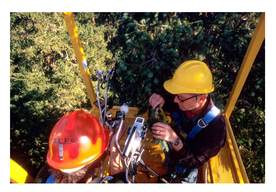
Fig. 9. Physiological study of in situ tree photosynthesis using the gondola of the canopy crane.

How do big trees deal with water stress, and does this differ from small trees? What are the physiological limitations on growth as trees age and increase in height? Is the phenomenon of hydraulic lift common in forest trees of the Pacific Northwest and what are its consequences? How do fertilizer and tree spacing affect tree productivity? How does water utilization scale with tree size, stand age, and across species? These types of questions are being asked at Wind River. Understanding the physiological response and performance of trees is important in predicting how trees will grow, whether they sequester carbon, and how they will respond to climate change (Fig. 9).