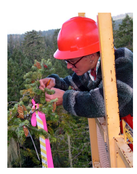
Fig. 1. Examining needles for herbivory at the top of a 60-m Douglas-fir.

The WREF includes a mosaic of age classes resulting from a major fire in the late 1840s, the extensive 1902 Yacolt Burn (Fig. 3) and subsequent reburns, and a variety of stands that have been managed since the early 1900s. The Yacolt fire burned over 200,000 acres (81,000 ha) and 38 people died. It burned more than 36 hours, at speeds up to 87 mph, with flame lengths of 30 feet and a heat intensity of 1,000°F. There were at least five re-burns. The original fire was started by slash and settler fires fanned by east winds.