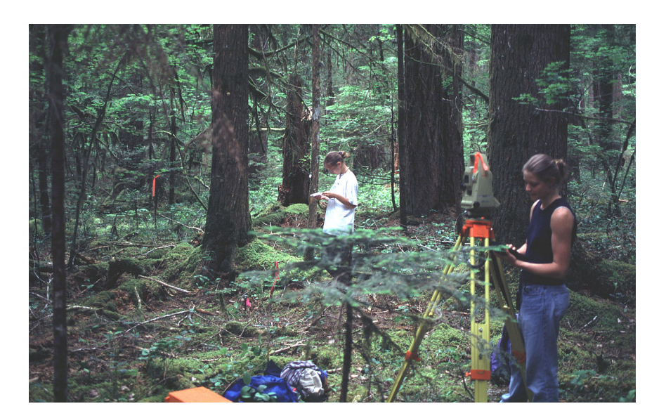
Fig. 13. Earthwatch Team, Student Challenge Award Program (high school students), mapping the forest using Nikon Total Station.

Academic classes from universities, colleges, community colleges, and a few high schools spend from half a day to 14 days on field trips or field classes at Wind River. There are no large dormitories, but housing is available in one bunkhouse (24), two houses (for 12 and 8; Fig. 12), and various camping loca-