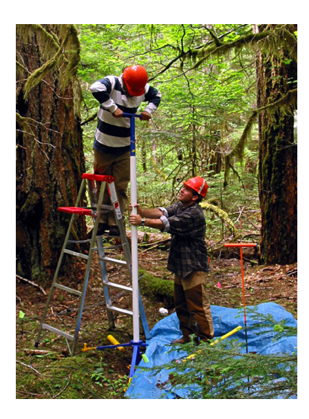
Fig. 5. Installing soil moisture probes in an old-growth forest adjacent to permanent sample plots.

The canopy crane, with its forest canopy access capabilities, is a central feature of the WRCCRF and WREF (Shaw et al., in press ). The old-growth forest (~ 500 years old) under the crane is a mix of Douglas-fir, western hemlock, western redcedar, Pacific silver fir, and Pacific yew. Researchers step into a gondola at the forest floor and are lifted up to their desired locations. The crane is operated by a Research Tower Crane Operator who sits 74 m above the forest floor in an operator's cab. An arbornaut accompanies researchers in the gondola. The arbornaut communi-