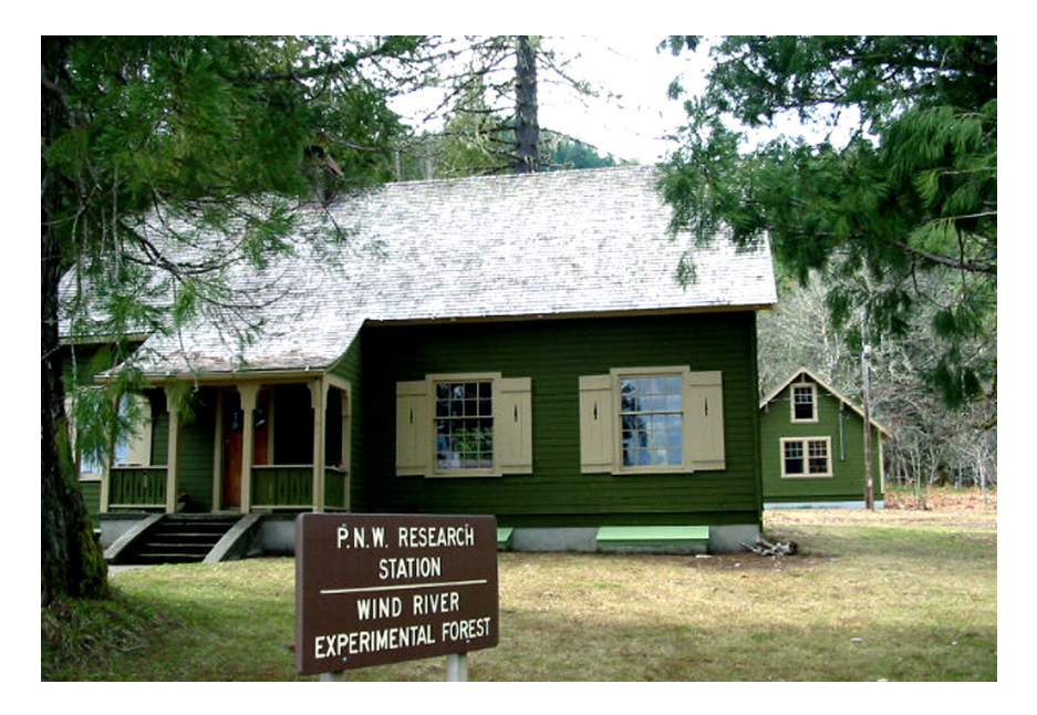
Fig. 12. The PNW House (CCC construction) used for bunking field crews year-round.

work called Fluxnet. These networks are key to understanding ecosystem function and productivity on continental scales. As data are analyzed and synthesized, new paradigms about net ecosystem exchange of carbon with the atmosphere are emerging. The networks can have economic implications because of questions regarding the role of forests in offsetting carbon emissions by industrialized countries. The United States may be sequestering more carbon than it is releasing.