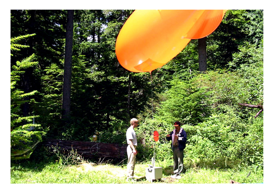
Fig. 10. Helium balloon used for studies of meso-scale climate modeling, supporting the Ameriflux instrumentation on the canopy crane.